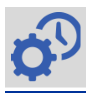
24/7 SERVICE & CONTROL